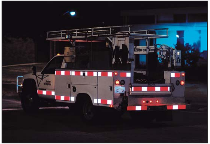
Marked vehicles are clearly visible even when backing up, crossing traffic or making turns.

3M Canada Company P.O. Box 5757 London, Ontario N6A 4T1 1-800-3MHELPS