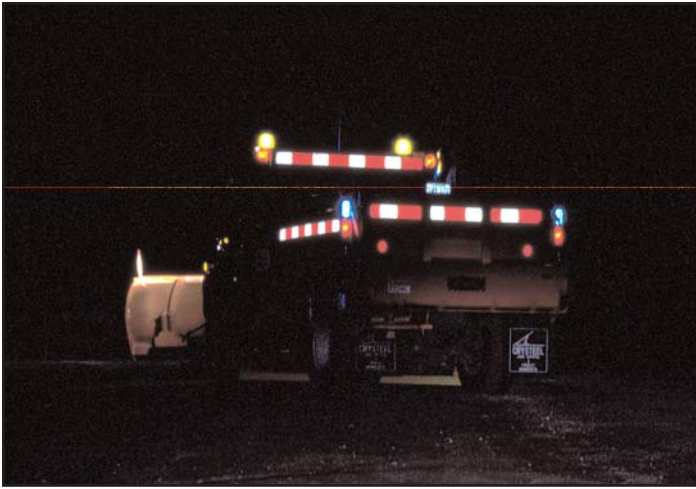
Studies show that heavy trucks with reflective markings experience 20% fewer nighttime collisions.

Studies show that conspicuity markings reduce the probability of serious accidents. Drivers rely on what they can see. And vehicles with reflective markings provide better visual information for faster, more accurate decision-making by drivers. This need for better visual information is particularly important when you consider the following factors: